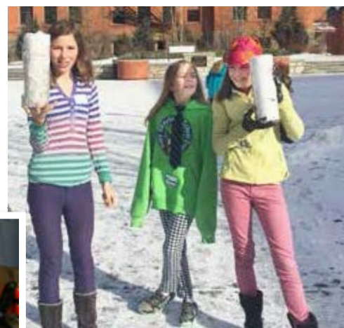
Elementary school students visited the MSU campus during an out-of-school day to learn about snow science, microbiology and the carbon cycle.