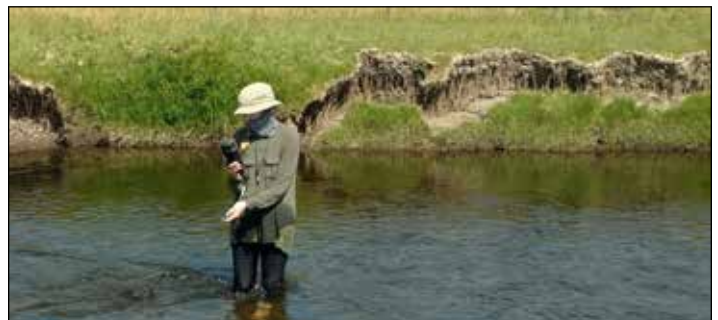
An undergraduate student researcher uses an electrical conductivity probe to measure water quality on the Upper Clark Fork River.

Stay informed through the Montana NSF EPSCoR website ( https://www.mtnsfepscor.org ), project newsletters, and Montana NSF EPSCoR annual meetings.