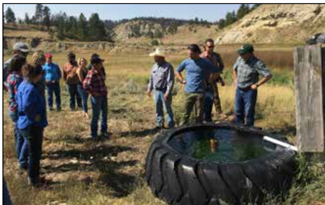
A developed natural spring on a central Montana ranch.