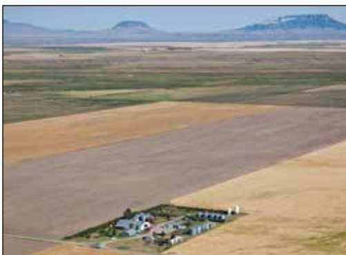
Aerial view of a farm near Stanford.

Due to exceptionally shallow unconfined aquifers and gravelly soils, agricultural activities in the Judith River Watershed over the last century have gradually resulted in high levels of nitrate and low