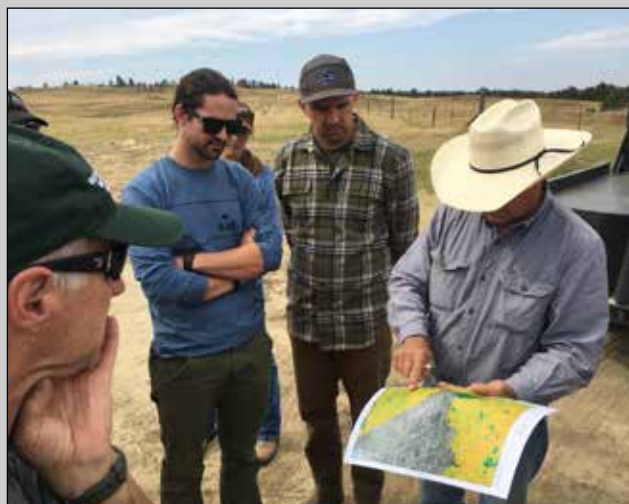
A Montana landowner hosts faculty and graduate students at a restoration project.

CREWS social scientists will study how factors such as social trust and governance processes affect community resilience. Across all the project research sites, CREWS researchers will gather information through focus