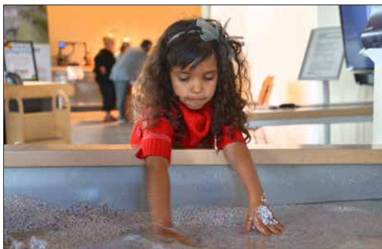
A child plays with the Erosion Table exhibit at the spectrUM Discovery Area.

Partners for CREWS outreach and education activities include UM Broader Impacts Group (BIG) and MSU Academic Technology and Outreach (ATO).