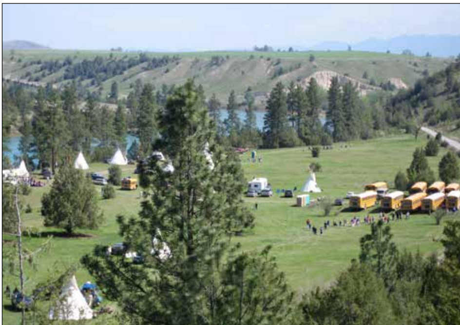
Site of the annual River Honoring, a 2-day outdoor environmental education event coordinated by the Confederated Salish and Kootenai Tribes for over 30 years. The event is geared towards the approximately 1,000 4th and 5th graders attending schools on the Flathead Reservation.

The CREWS project will involve Native American researchers and students through other avenues, such as seed funding opportunities for researchers and students at other Montana Tribal Colleges. CREWS will support Native American graduate students pursuing STEM degrees, as well as programs providing STEM opportunities to Native American undergraduate and high school students. Partners for these programs include UM's Indigenous Research and STEM Education (IRSE) and MSU's American Indian Research Opportunities (AIRO).