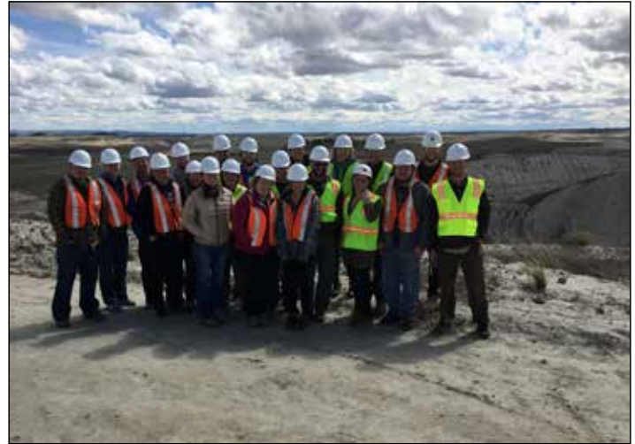
Students in an Energy Resource Geography course participate in a guided tour of the coal extraction process at the West Rosebud Mine.

The Powder River Basin research will ramp up over the five-year project period. The CREWS research team will focus on understanding the impacts of coal mining