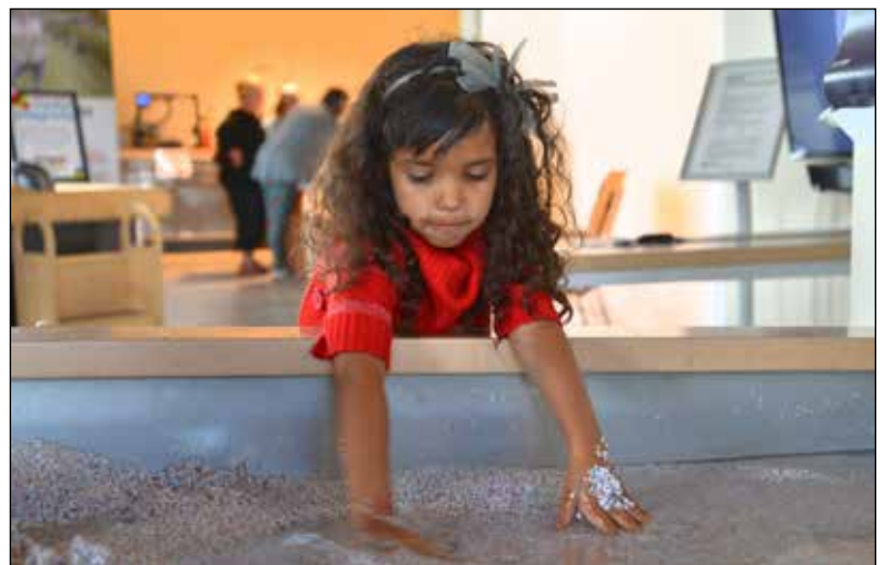
A child plays with the Erosion Table exhibit at the spectrUM Discovery Area.

Partners for CREWS outreach and education activities include UM Broader Impacts Group (BIG) and MSU Academic Technology and Outreach (ATO).