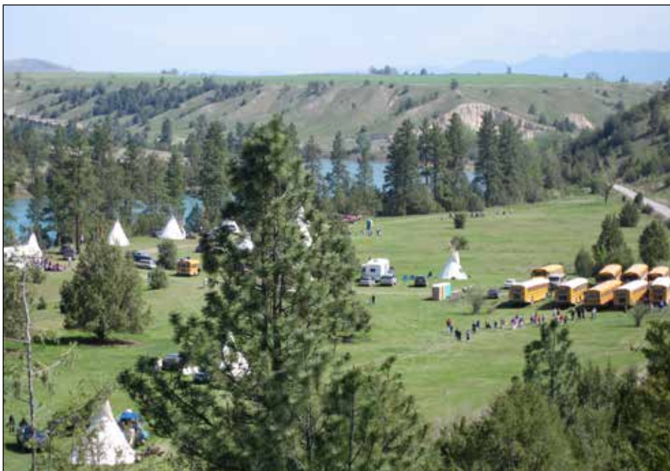
Site of the annual River Honoring, a 2-day outdoor environmental education event coordinated by the Confederated Salish and Kootenai Tribes for over 30 years. The event is geared towards the approximately 1,000 4th and 5th graders attending schools on the Flathead Reservation.

The CREWS project will involve Native American researchers and students through other avenues, such as seed funding opportunities for researchers and students at other Montana Tribal Colleges. CREWS will support Native American graduate students pursuing STEM degrees, as well as programs providing STEM opportunities to Native American undergraduate and high school students. Partners for these programs include UM's Indigenous Research and STEM Education (IRSE) and MSU's American Indian Research Opportunities (AIRO).