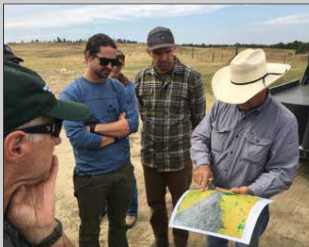
A Montana landowner hosts faculty and graduate students at a restoration project.

CREWS social scientists will study how factors such as social trust and governance processes affect community resilience. Across all the project research sites, CREWS researchers will gather information through focus