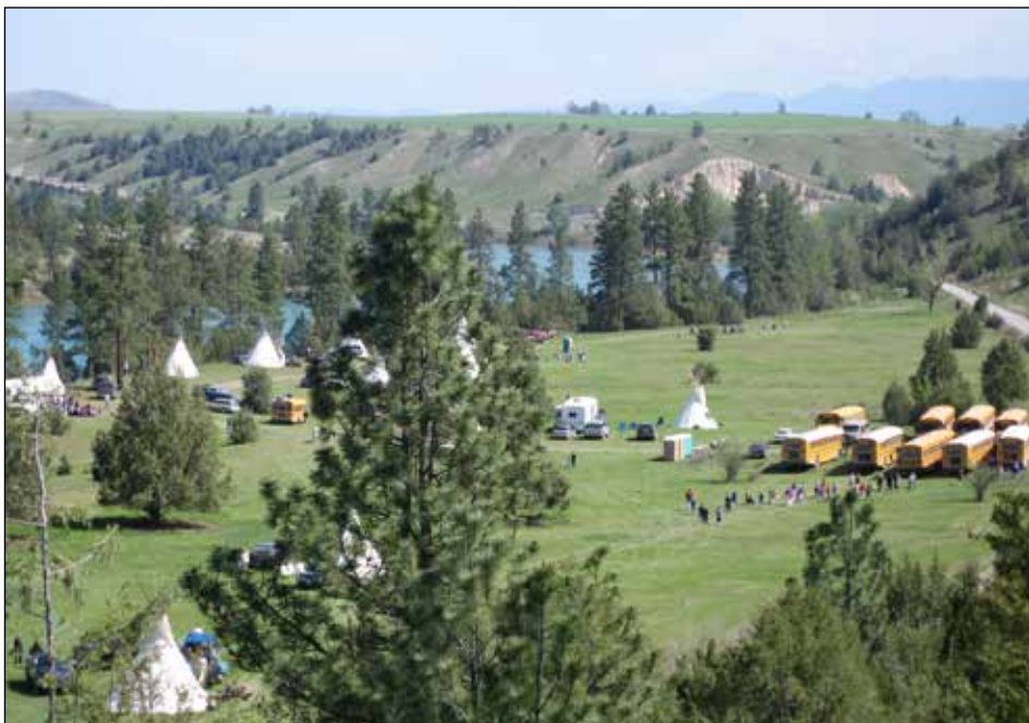
Site of the annual River Honoring, a 2-day outdoor environmental education event coordinated by the Confederated Salish and Kootenai Tribes for over 30 years. The event is geared towards the approximately 1,000 4th and 5th graders attending schools on the Flathead Reservation.

The CREWS project will involve Native American researchers and students through other avenues, such as seed funding opportunities for researchers and students at other Montana Tribal Colleges. CREWS will support Native American graduate students pursuing STEM degrees, as well as programs providing STEM opportunities to Native American undergraduate and high school students. Partners for these programs include UM's Indigenous Research and STEM Education (IRSE) and MSU's American Indian Research Opportunities (AIRO).