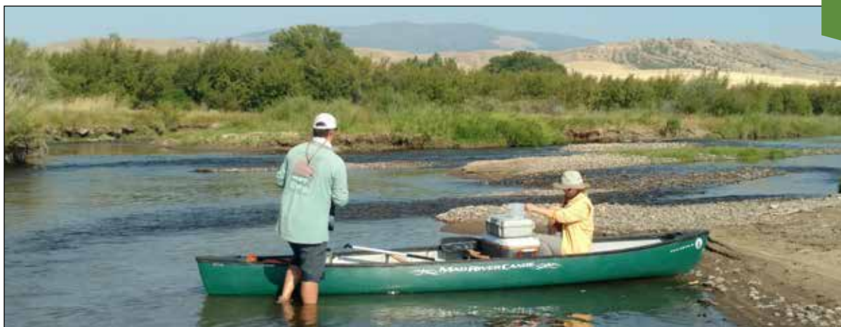
Water sampling on the Upper Clark Fork River.