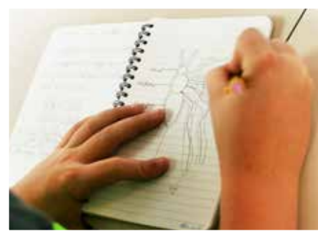
ABOVE: Dan Vanderpool guides students in detecting signs of pine beetles in samples of wood. BELOW: Students received waterproof field journals to document their notes and data—here a student sketches and labels the parts of an insect.