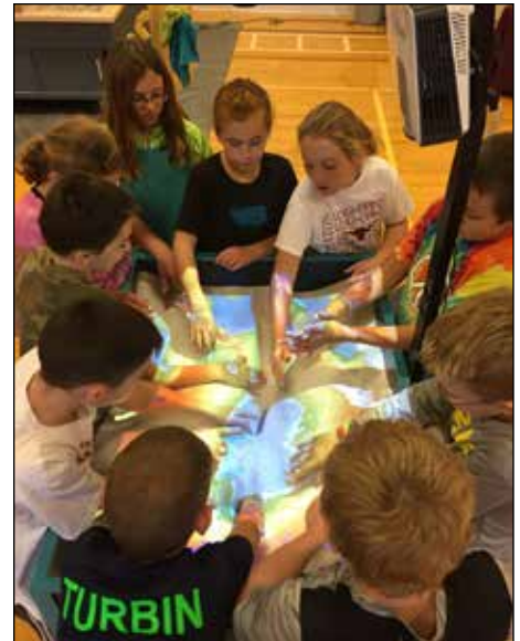
At spectrUM’s Virtual Watershed Sandbox, students can create 3D topography models by shaping sand.

Today, spectrUM engages more than 55,000 Montanans annually through in-museum and statewide mobile programming. Seeded with a grant from NSF EPSCoR, spectrUM now operates on a $2 million annual budget that supports its Missoula museum, a statewide mobile